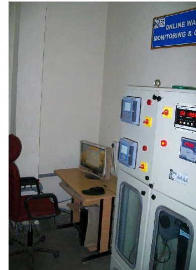
Online Water Quality Monitoring System