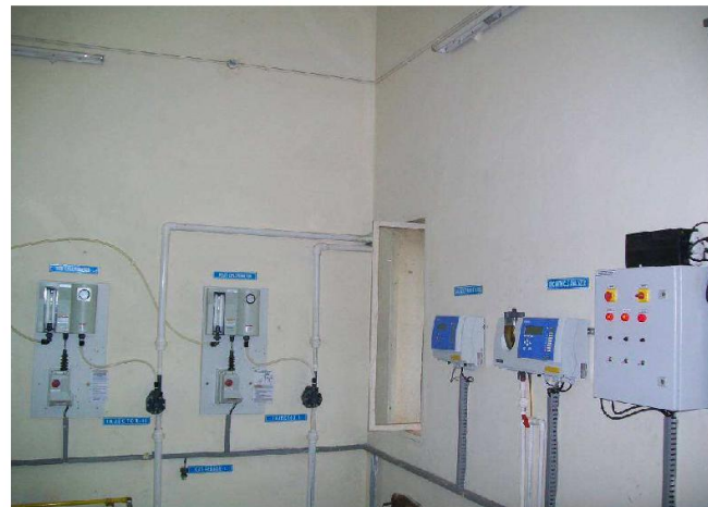
Auto Chlorination & Chemical Feed System